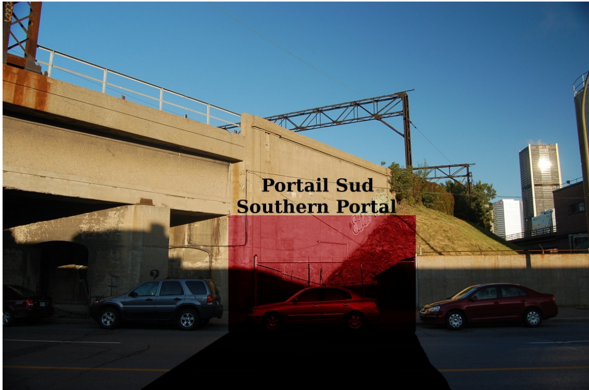
Figure 1. Southern Tunnel Portal and the dangerous blind intersection with Wellington St.