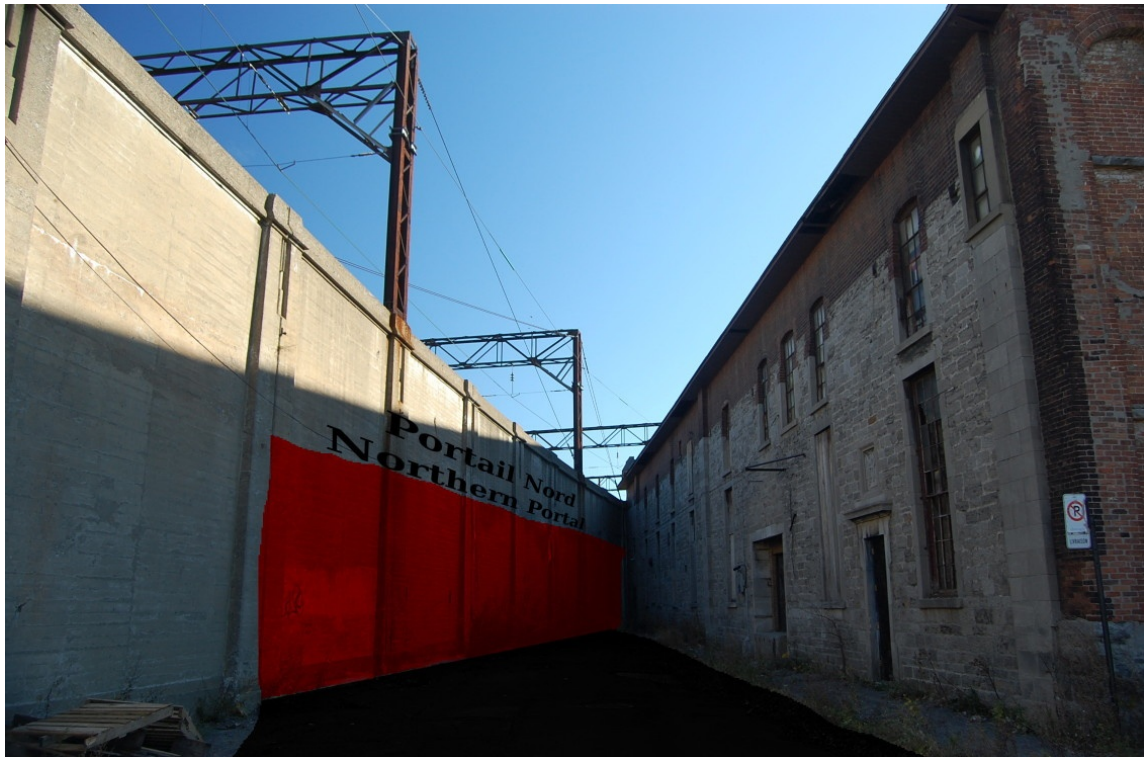
Figure 2. Northern Tunnel Portal and its extreme proximity to the historic New City Gas Co. (1847)